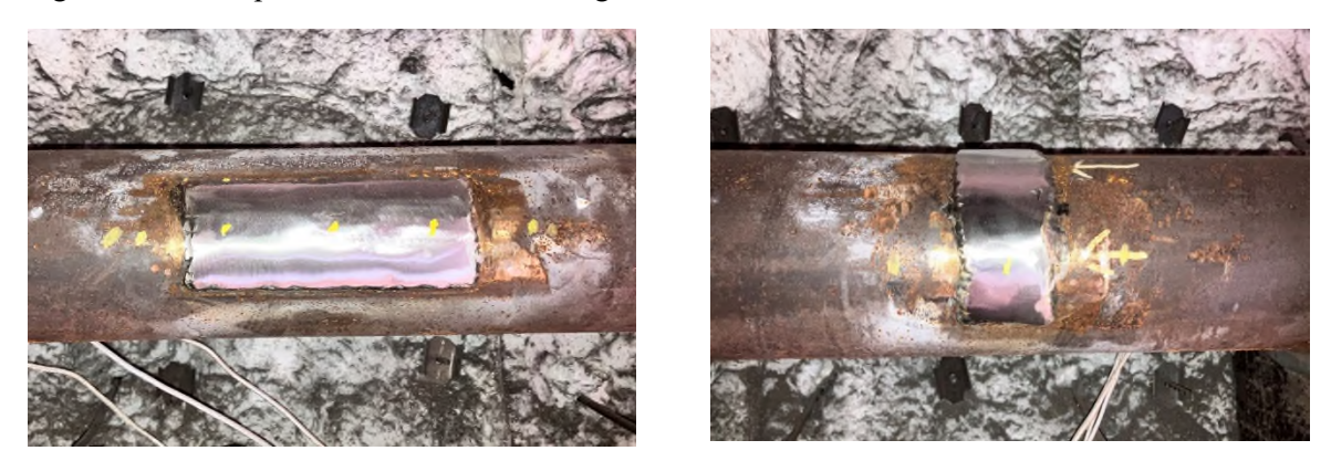
Figure-1 : Butter-pad installed on tubes, longitudinal and traverse